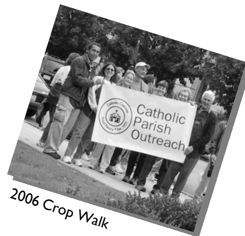
2006 Crop Walk