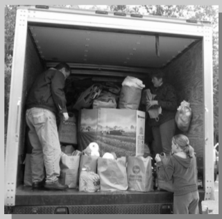
'Feed a Family' Food Drive