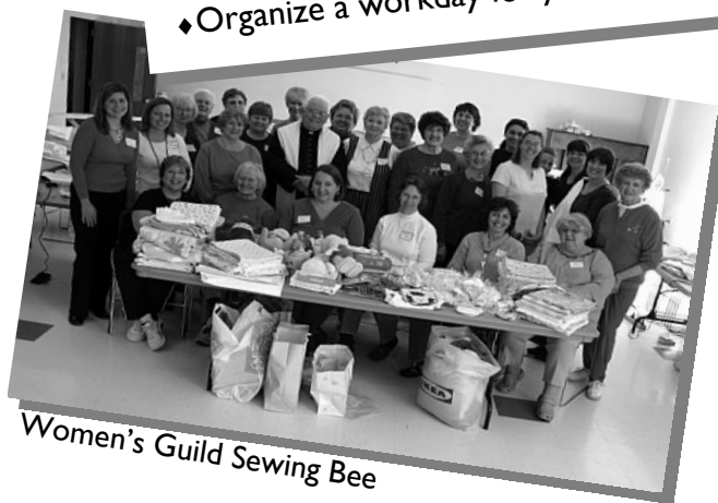
Women's Guild Sewing Bee